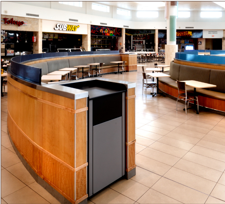
Veneer-Art 926 Canadian Maple